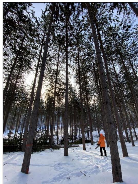
Figure 1. Plantation Thinning at Byer's Creek Tract

Two County of Renfrew staff completed all planning (timber cruising, analysis, prescription writing), layout, tree marking, tendering, wood measurement and operations monitoring activities.