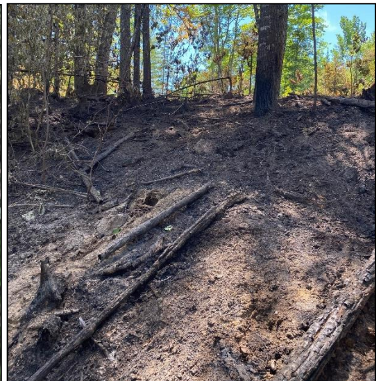
Figure 5. Forest Fire at Opeongo