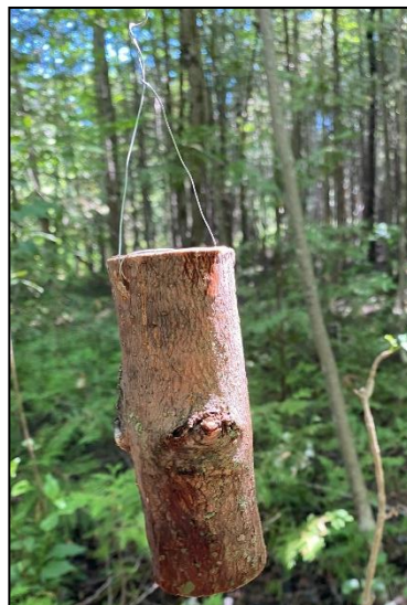
Figure 4. EAB Parasitoid Release