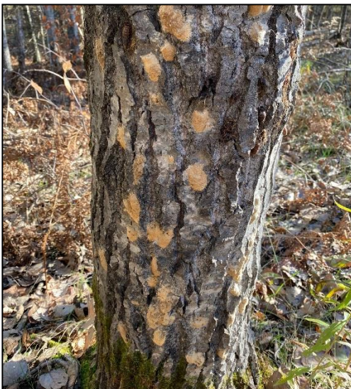
Figure 3. LDD Moth Egg Masses, Sperberg

With more people on the landscape in the current pandemic climate we are in, there was an increase in access complaints, dumping, trespass concerns and other issues.