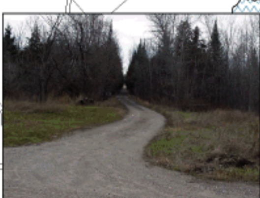
8 K&P Trail - geographic Township of Bagot Intersection of Ashdad Road and the K&P Trail View to the south from Ashdad Road (0930)