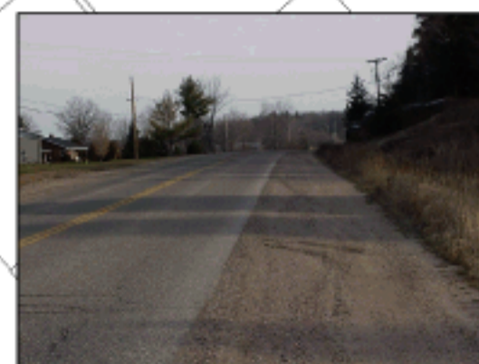
19 K&P Trail - geographic Township of Admaston Intersection of Highway 132 and K&P Trail View to the east along Highway 132 (0894)