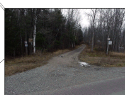
3 K&P Trail - geographic Township of Bagot Entrance to K&P Trail from Calabogie (City Rd 101) Looking south from Calabogie Road (089A)