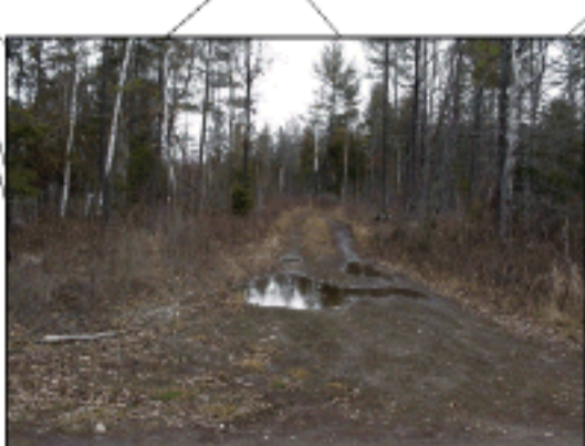
4 K&P Trail - geographic Township of Bagot Private crossing over K&P Trail East View (0958)