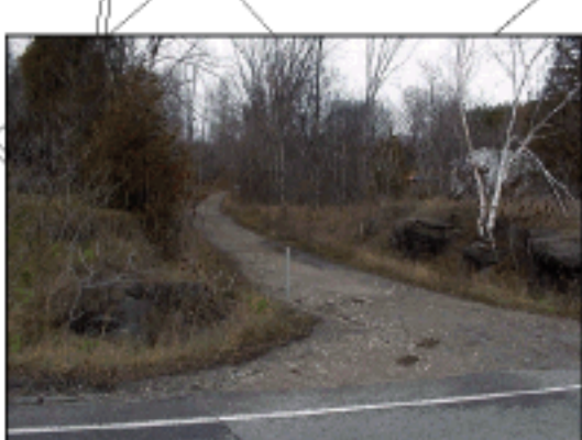
2 K&P Trail - geographic Township of Bagot Entrance to K&P Trail from Lanark Road (City Rd 511) Looking north from Lanark Road (0884)