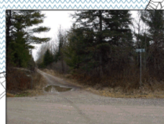
5 K&P Trail - geographic Township of Bagot Private crossing over K&P Trail South View from Murphy Road (0890)