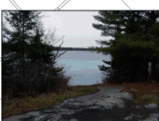
6 K&P Trail - geographic Township of Bagot Private access off east side of K&P Trail to Norway Lake View to the East (0860)