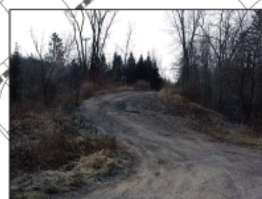
15 K&P Trail - geographic Township of Admaston Intersection of Fergusina Road and the K&P Trail View south from Fergusina Road (0914)