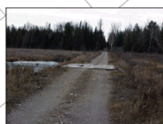
9 K&P Trail - geographic Township of Bagot Wood & Mason Bridge on K&P Trail View to the north (0820)