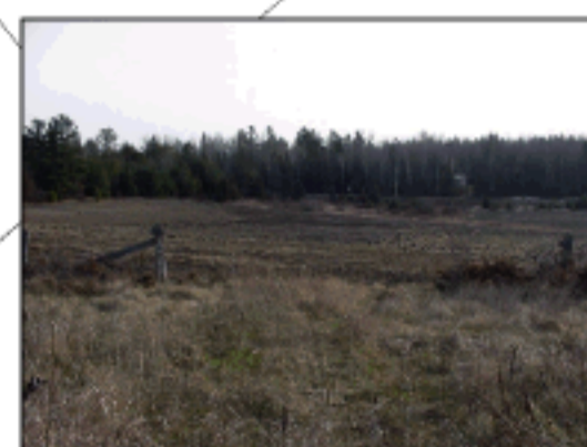
17 K&P Trail - geographic Township of Admaston Private crossing over K&P Trail View to the East (0819)