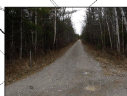
7 K&P Trail - geographic Township of Bagot Intersection of Murphy Road and K&P Trail View south from Murphy Road (0890)