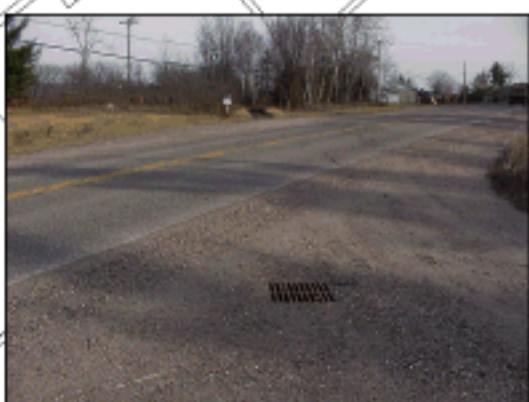
18 K&P Trail - geographic Township of Admaston Storm Drain in Middle of K&P Trail at Intersection with Hwy 132 Northeast View (0678)