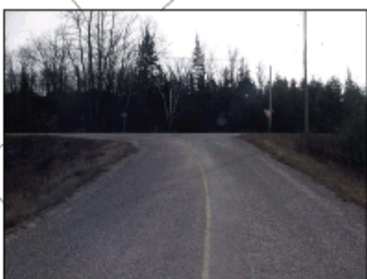
16 K&P Trail - geographic Township of Admaston Intersection of Kumpaski Road and K&P Trail View to the east along Kumpaski Road (0950)