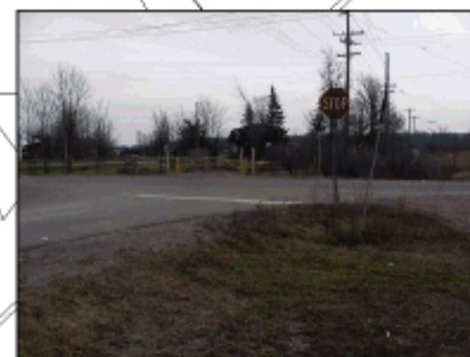
21 K&P Trail - geographic Township of Admaston Intersection of Riverview Drive, Highway 132 and K&P Trail View to the east from K&P Trail (0644)