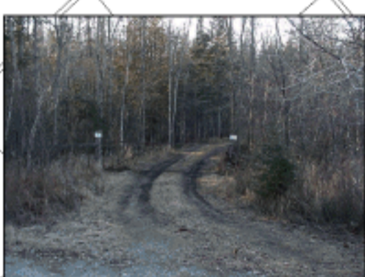
13 K&P Trail - geographic Township of Admaston Private crossing over K&P Trail View to the West (0847)