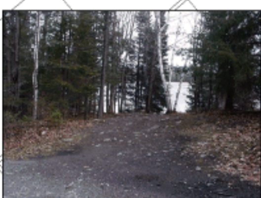
17 K&P Trail - geographic Township of Admaston Private entrance off of east side of K&P Trail to Miller Lake View to the East (0817)