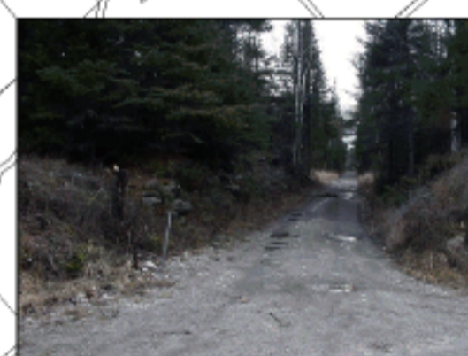
11 K&P Trail - geographic Township of Bagot Intersection of Pucker Street and K&P Trail (0816)