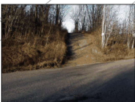
14 K&P Trail - geographic Township of Admaston Intersection of Fergusina Road and the K&P Trail View north from Fergusina Road (0887)