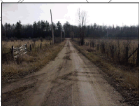
20 K&P Trail - geographic Township of Admaston Intersection of McLaren Road and K&P Trail View to the east along McLaren Road (0846)