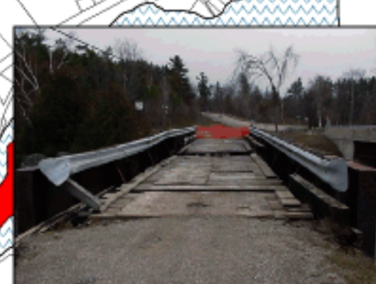
1 K&P Trail - geographic Township of Bagot Wooden Bridge over Madawaska River at City Rd 511 Looking south - Close-up view (086A)