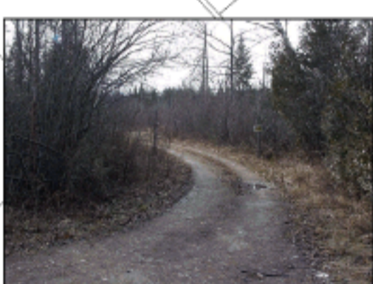
10 K&P Trail - geographic Township of Bagot Crossing over K&P Trail View to the west (0828)