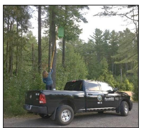
Figure 5. Hanging an EAB Trap at Shaw Woods.