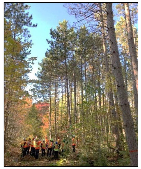
Figure 3. Attendees of 2019 CIF Conference at Marsh Road Tract.

For the 5<sup>th</sup> year in a row, the University of Guelph completed tick surveys for research on RCF. The Renfrew County and District Health Unit (RCDHU) also surveyed several Tracts. Survey results at Chippior's Corner and Springtown by RCDHU led to these areas being identified as risk areas for Lyme disease.