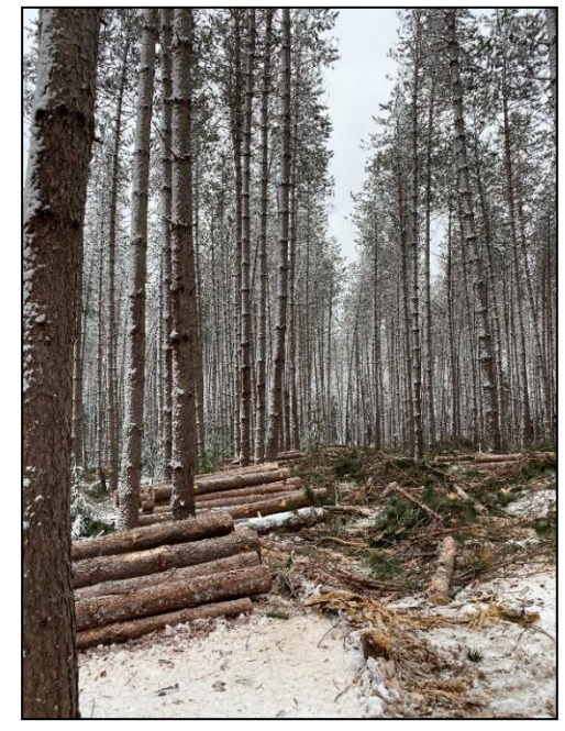
Figure 1. Thinning operation at Maves Tract, December.