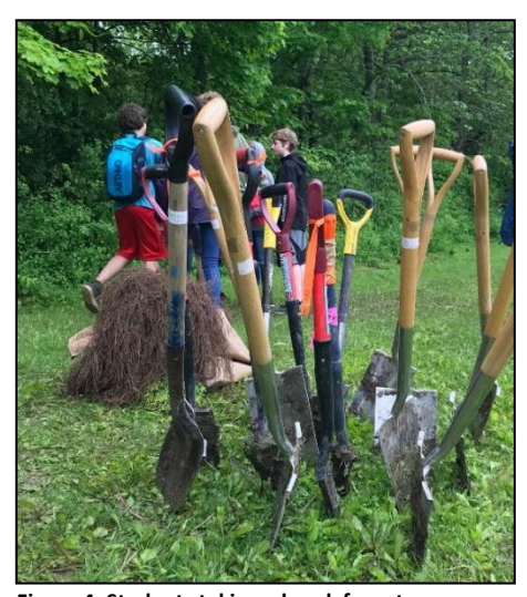
Figure 4. Students taking a break from tree planting at the Forest Life Expo.