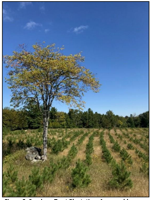
Figure 2. Sperberg Tract Plantation, 4 years old.