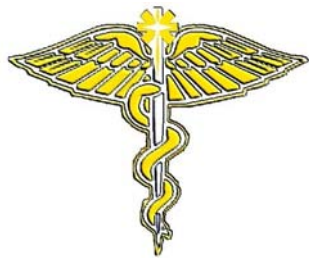
County of Renfrew Paramedic Services and Heart & Stroke Foundation in partnership!