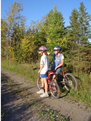
Enjoying a local trail

The County of Renfrew has reaffirmed its support for the promotion of one its greatest resources: local trails. The county was recently awarded a grant from the Renfrew County Community Futures Development Corporation to assist in the purchase of an abandoned rail line that runs through Laurentian Valley towards Algonquin Park. The abandoned CN Corridor is a 32-kilometre line that captures the picturesque beauty of the area. In the spring of 2006, the County of Renfrew identified the need to develop a Trails Strategy to gauge public interest in trails, trails-oriented activities and enhancing existing trails and providing trail opportunities that previously did not exist and thereby improving the social and economic well being of the residents of the