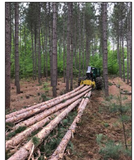
Figure 2. Operations underway at Round Lake Tract