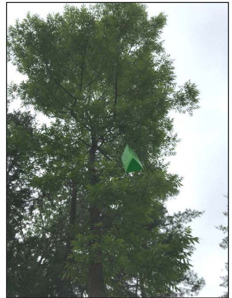
Figure 4. Emerald Ash Borer Trap

Forestry staff assisted Public Works with hazard tree assessment in Arnprior, particularly on ash trees infested with Emerald Ash Borer.