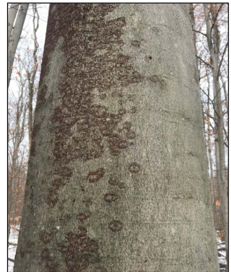
Figure 5. Heavy infestation of Beech Bark Disease at Carswell's Mountain Tract