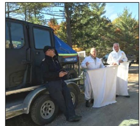
Figure 6. Paramedic Services, RCDHU and Forestry staff all at Springtown Tract