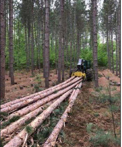
Figure 2. Operations underway at Round Lake Tract