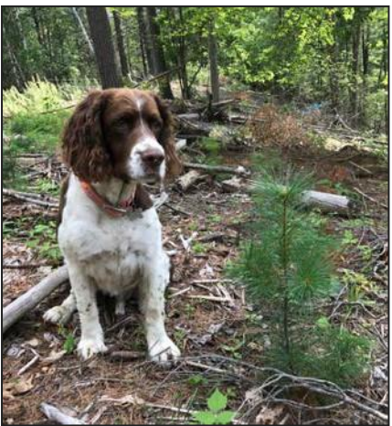
Figure 3. Checking 2017's tree plant success