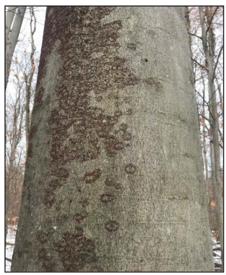
Figure 5. Heavy infestation of Beech Bark Disease at Carswell's Mountain Tract