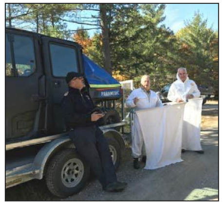
Figure 6. Paramedic Services, RCDHU and Forestry staff all at Springtown Tract