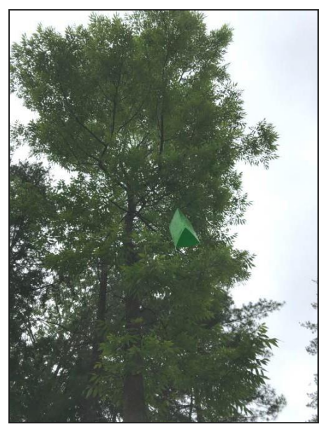
Figure 4. Emerald Ash Borer Trap

Forestry staff assisted Public Works with hazard tree assessment in Arnprior, particularly on ash trees infested with Emerald Ash Borer.