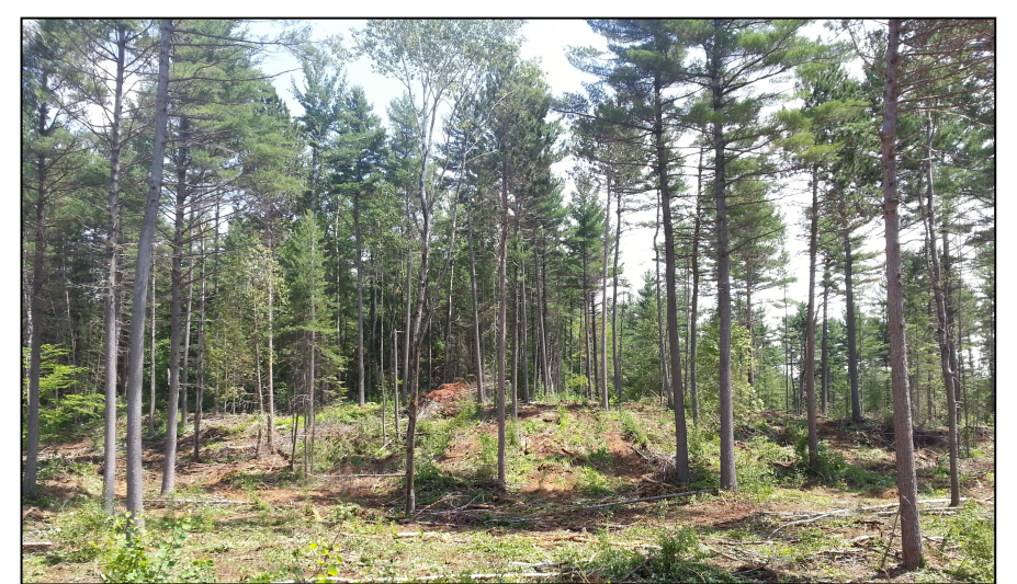
Figure 3. Example of a Seeding Cut, after mechanical site preparation.

Once the pine understory has been successfully established and is well on its way to success (>6m tall), most of the overstory will be removed to make room for the next generation. Veterans will be retained, but as we have seen with recent mortality and blowdown – trees don't live forever.