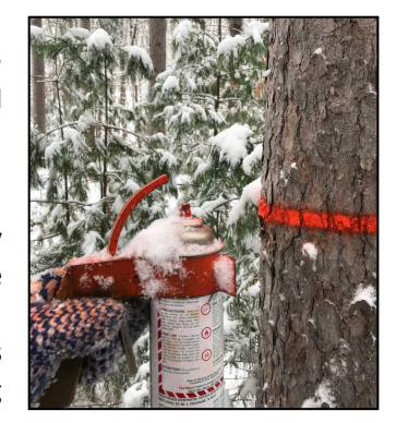
Figure 1. Trees are marked orange for harvest.