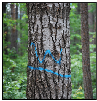
Figure 2. Trees are marked blue for wildlife value.

Of course, there will be temporary disruption to trail use during harvest and regeneration treatments. This work is necessary to ensure that future forest users – human and wild! – will be able to enjoy a beautiful pine forest like we do today. As we have in the past, we will work with the wonderful folks at BORCA and Snow Country to ensure the disruption is as minimal as possible. We hope you will enjoy seeing the future forest develop as we complete our work!